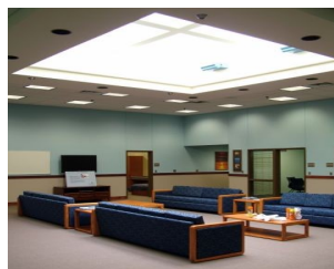
This is the Common Area where the youth gather for group activity and to socialize.