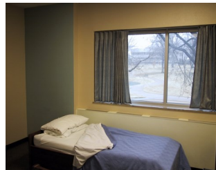
Each sleeping room can accommodate up to four and has its own private bathroom.